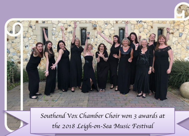
Southend Vox Chamber Choir won 3 awards at the 2018 Leigh-on-Sea Music Festival

"My heart is gladder than all these Because my love is come to me."